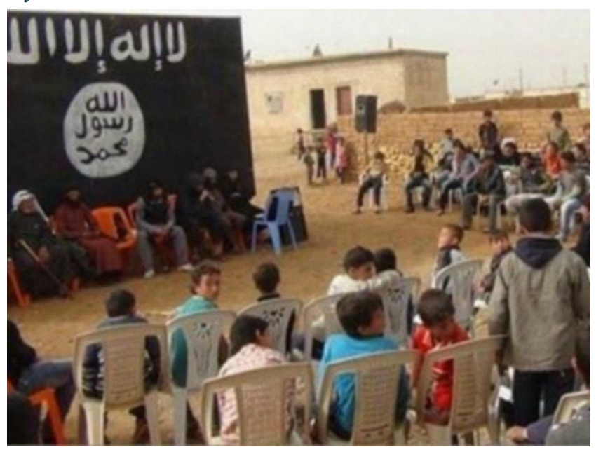
ISIS is teaching in a local school outside of Kabul: Courtesy of Frontline News